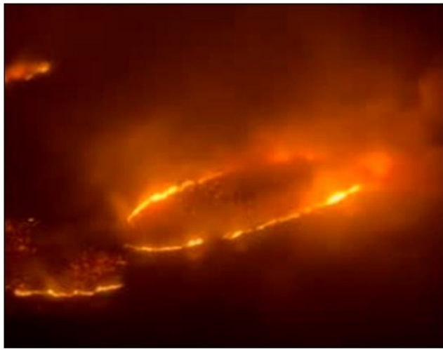
Pic taken from passenger plane flying into Maui