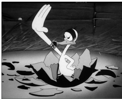
Looney Tunes’ 1942 Short, “The Ducktators”

As Christians, we are called to pray AND WORK against the plans of the enemy. Whatever happens, we should not fear. God wins! (Psalm 37)